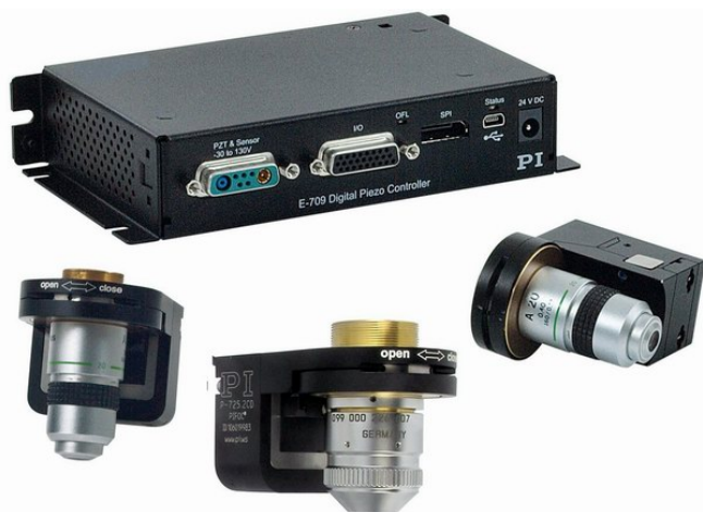
Several PIFOC ® piezo objective scanners (fast focus mechanisms) with QuickLock thread adapter and digital controller (objective not included)